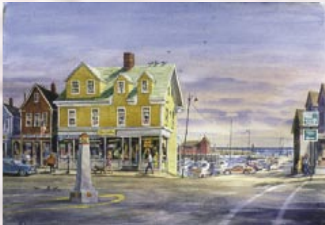
Sandcastle Shops and Harbor Scene