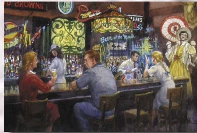
At the Bar with Jamie Farr